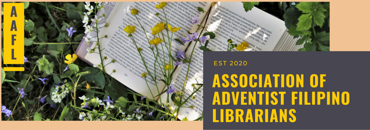
Photo taken from AAFL's Facebook group page.